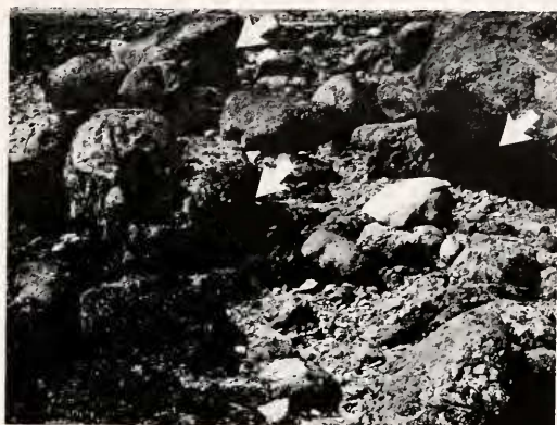
Fig. 2. Specific collection sites of Paraphrosylus from shaded portions of Fucus covered rocks (arrows).